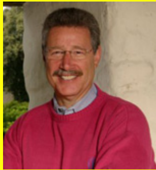
Author Barry Posner

This is the first true revision of Credibility since its initial publication in 1993. Why revise it now?