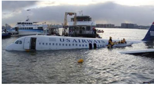
The final group of passengers to be rescued floats on an escape slide attached to the left side of the sinking Airbus as daylight fades.